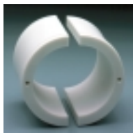
Split Flow Reducer

* All components required for proper operation of the CPM Seal Support Reservoir. The cooling coil is optional. Note: The CPM Seal Support Reservoir is operational as an API Plan 52 or 53.