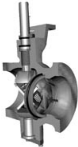
Fig. 2. The NAF-Trimsector with Z-trim in partial open position