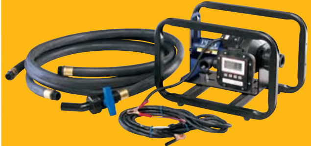
PH6 CADDY System with SEM-10 Flow Meter

The PH6 CADDY System includes: the tubular frame; the PH6 pump with 12-volt motor; an SEM-10 flow meter; a ball valve and spout; and two 25 mm (1 in) EPDM hoses. Other configurations are available and may include the SEM-10SS flow meter or the 110-volt motor.