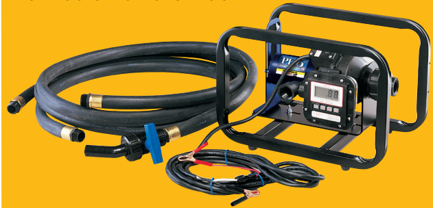
PH6 CADDY System with SEM-10 Flow Meter

The PH6 CADDY System includes: the tubular frame; the PH6 pump with 12-volt motor; an SEM-10 flow meter; a ball valve and spout; and two 25 mm (1 in) EPDM hoses. Other configurations are available and may include the SEM-10SS flow meter or the 110-volt motor.