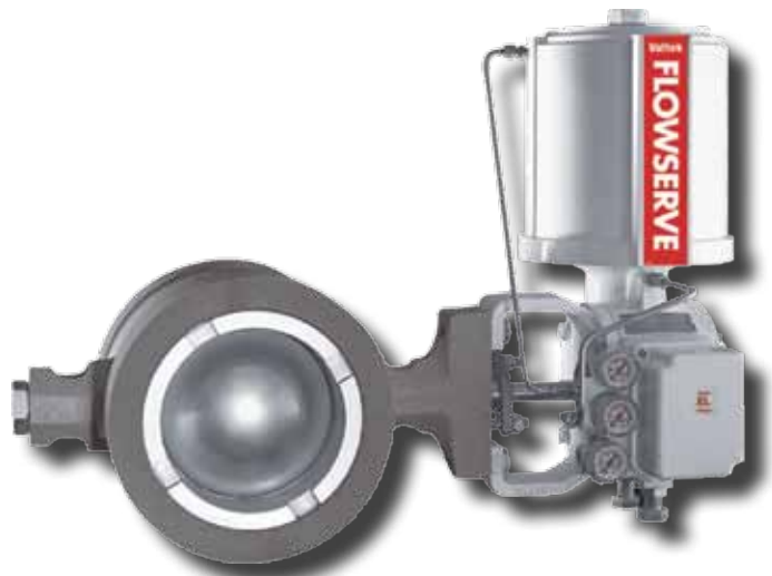
Valtek ShearStream HP