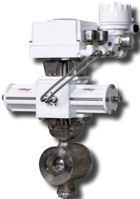
Valtek ShearStream SB

effective continuous operation. They have an extremely long life span as all parts are of highest quality. And they'll still be safe in the future as they use advanced technology and innovative solutions. Flowserve ensures a safe and cost-effective operation for our customers all over the world