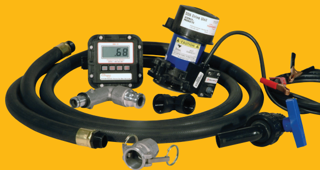
DD6 Drive Unit and Accessories

Bulletin PSS-90-20.2e (E) Printed in USA. January 2011. © Flowserve Corporation