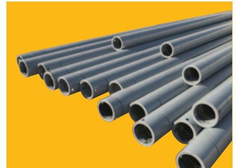
Drill Stem Assembly

Bulletin PSS-90-6.11 (E/A4) August 2012. © 2012 Flowserve Corporation