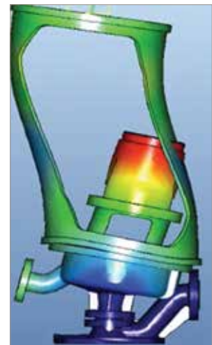
Mode shape illustration

To learn more about Flowserve pump field testing programs and the unequalled technical capabilities of its PIE team, contact your local Flowserve representative.