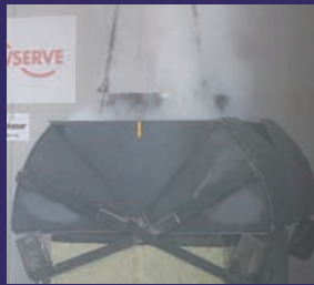
Hot oil submersion testing

Components met all design and application requirements.