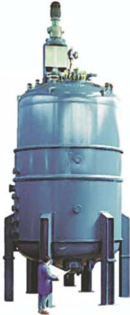
Glass Lined Mixer manufactured by De Dietrich Glass Lined Equipment